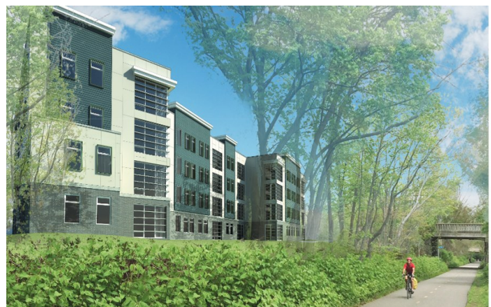
Proposed Downing Square building along the bike path

Last August, HCA purchased a one-acre parcel at 19R Park Ave that will soon become Downing Square Apartments. The site is behind the CITGO station at the intersection of Park Ave and Lowell Street in Arlington and stretches back from Lowell Street to the Minute-man Bike Path then runs along the bike path for several hundred feet. HCA's proposed project has two buildings, one facing the bike path running east to west and one at the corner of Lowell Street and Park Ave. The plan includes environmental cleanup of the lot and will provide 34 units of affordable housing to households making 60% or less of the area median income.