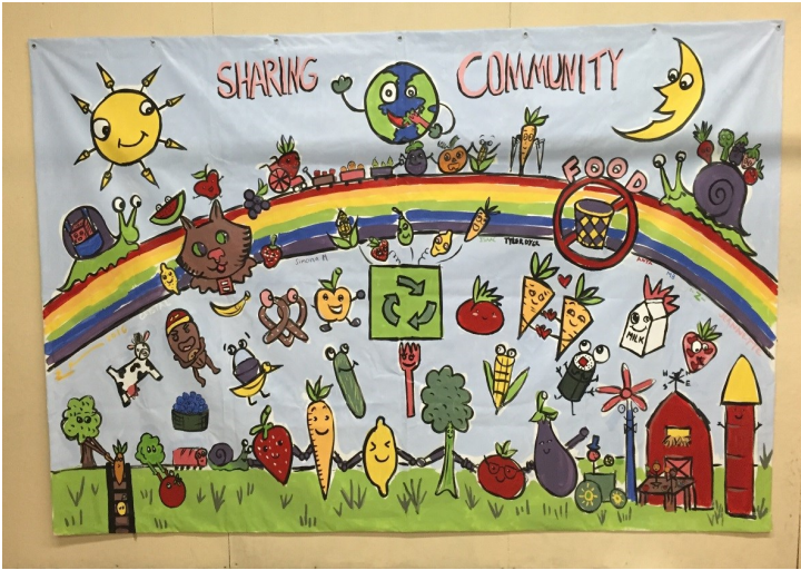
Mural created by Queer Mystic

On Friday, May 19, Mystic LGBTQ+ Youth Support Network (Queer Mystic) and Robbins Library co-sponsored a youth Drag Prom here in Arlington. Members of the Boston Area Homeschoolers Queer Straight Alliance (BAHS QSA), a program of Queer Mystic, planned the event, provided music and delicious snacks, and did the preparation and decorating.