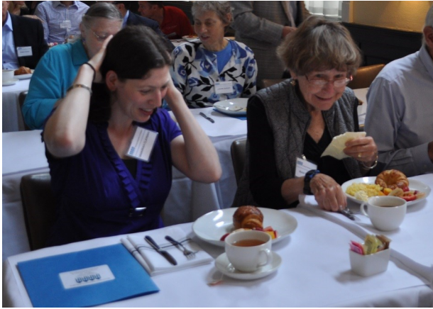
Breakfast at Bistro Duet in June