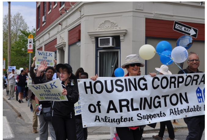
Over 120 people walked

Over 120 people marched down Mass Ave. waving signs displaying WALK FOR AFFORDABLE HOUSING in bold font. Cars blared their horns in agreement, and onlookers cheered as the Hot Tamale Band announced the walkers. Everyone had a fabulous time supporting a very serious cause and working to solve the housing issue.