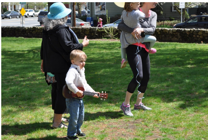
A young musician serenades the walkers

April 30 was a sunny, early spring Sunday, perfect for HCA's 16th annual Walk for Affordable Housing starting on Arlington's historic Jason Russell House Commons.