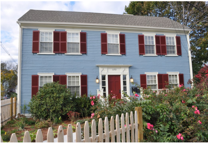
Kimball Farmer House, 1173 Mass. Ave.