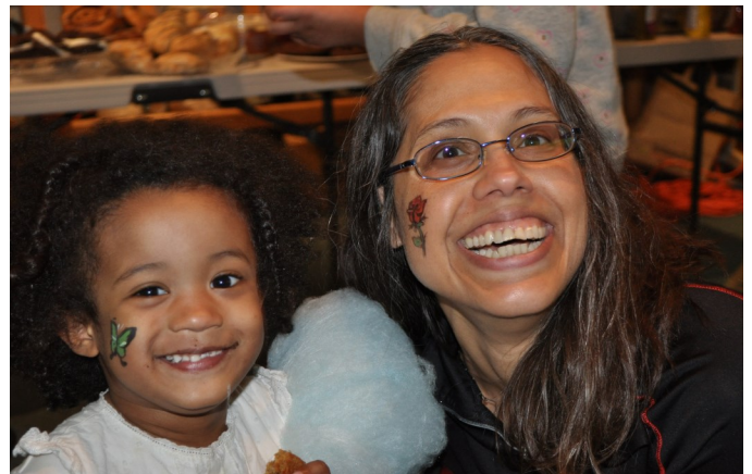
The face painting was a big hit!