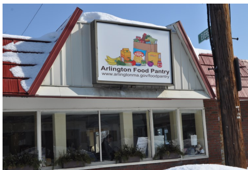
Exterior of Arlington Food Pantry, 117 Broadway

The Arlington Food Pantry has been the primary food distribution facility for residents in need for more than 25 years. Since November of 2014, the AFP has been able to more