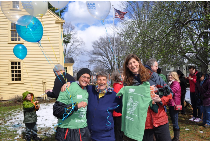
15th Annual Walk for Affordable Housing

In addition to the Walk from the Jason Russell House down Mass. Ave. and back, people enjoyed a festive atmosphere with friends and neighbors, lots of delicious treats, balloons and a spirited raffle with over $4,500 in gifts donated by area merchants.