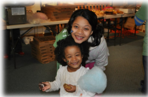
Enjoying the 15th Annual Walk for Affordable Housing