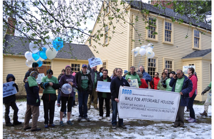
Walkers on the Jason Russell House lawn

Together, the 15 th Annual Walk for Affordable Housing earned almost $32,000 for the cause. A big thank you for your help!