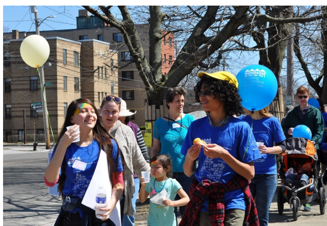
Walkers at Tufts Street