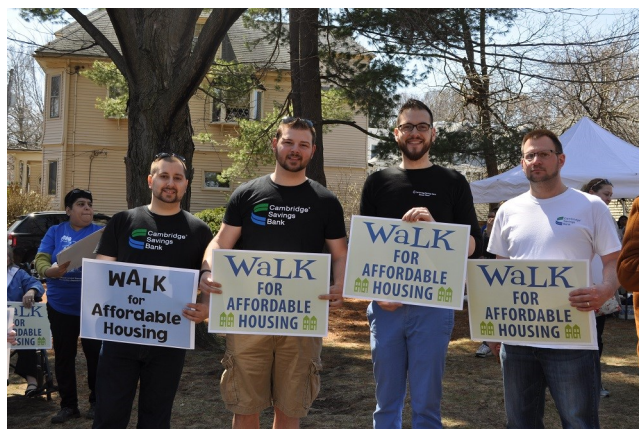
Cambridge Savings staff