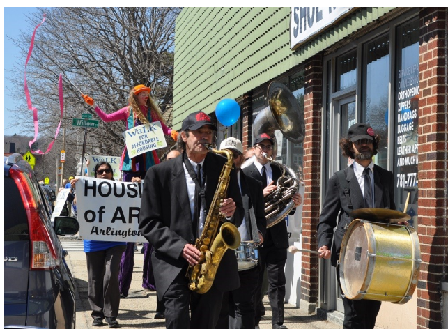
Hot Tamale Brass Band