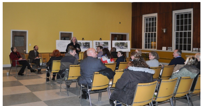
Community meeting for 20 Westminister 40B

In November 2014 HCA hosted a community meeting at our new 20 Westminister property to explain to neighborhood residents our plans for redeveloping the building into nine affordable housing units. Approximately 25 people attended. In general there was support for the plan. Much discussion ensued and many excellent suggestions were made, which were then incorporated into the project. Since then the project has progressed. HCA has submitted an application for a waiver of zoning, parking, and curb cuts, and is pursuing funding. A hearing in front of the Zoning Board of Appeals will be scheduled.