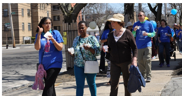
Walkers heading back