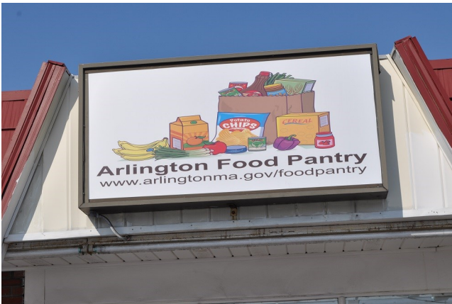
New Food Pantry signage

The 117 Broadway building opened as the second site for the Arlington Food Pantry in November 2014. The site is on a bus line, is wheelchair accessible, and has a large parking area. The Food Pantry is open four days a month and serves over 76 households during open hours with meats, staples, bread, vegetables, and fruit.