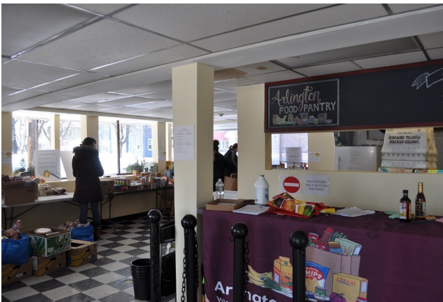
Interior of Food Pantry

The 117 Broadway building opened as the second site for the Arlington Food Pantry in November 2014. The site is on a bus line, is wheelchair accessible, and has a large parking area. The Food Pantry is open four days a month and serves over 76 households during open hours with meats, staples, bread, vegetables, and fruit.