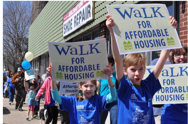
14th Annual Walk for Affordable Housing

The Community Investment Tax Credit Program was created by Chapter 238 of the Acts of 2012 and is administered by the Commonwealth's Department of Housing and Community Development. CITC requirements are set forth in Chapter 62 Section 6M and Chapter 63 Section 38EE; 760 CMR 68.00 and 830 CMR 62.6M.1. For more information, visit the Massachusetts CITC webpage: www.mass.gov/hed/community/funding/community-investment-tax-credit-program.html