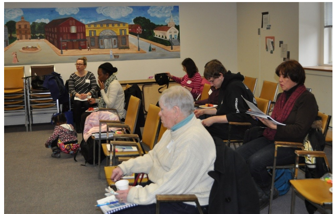
On a cold, snowy Saturday in February, participants stay warm at financial workshop

In February, Belmont Savings Bank staff members conducted a similar workshop for community members. Thanks to Belmont Savings Bank for a great workshop!