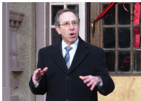
Aaron Gornstein, Massachusetts Department of Housing & Community Development's Undersecretary of Housing, speaks at the Capitol Square Apartments ribbon cutting celebration

systems, new roof, wall and roof insulation, insulated windows, some new kitchens and baths, stucco recoating, copper flashing, and preserving as much of the original detail as possible. Units will be affordable in perpetuity—serving low-income households at or below 60% of area median income. The buildings offer a mix of apartment sizes: 6 studio units, 17 one-bedroom units and 9 two-bedroom units with 32 units overall.