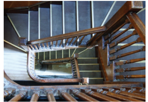
Renovations are underway at the Capitol Square Apartments thanks to the support from a complex mix of private and public financing.