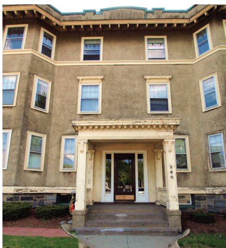
Capitol Square Apartments—construction to begin soon.

Some more dates to remember: On September 13, we will conduct informational sessions to explain the lottery process. Those will be held at 4 PM and 6 PM on the first floor of the Arlington Senior Center at 27 Maple Street in Arlington Center. We will accept applications until October 31. Then, on