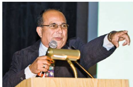
Ray Magliozzi of NPR's Car Talk