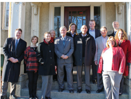
HCA was thrilled to show our state legislators around Capitol Square Apartments at a February breakfast meeting.

On October 17, Governor Patrick's office made an announcement that had us all holding our breath for months—our Capitol Square Apartments project was fully funded! With project funding now in place, HCA began to move full-steam ahead with our plans for this