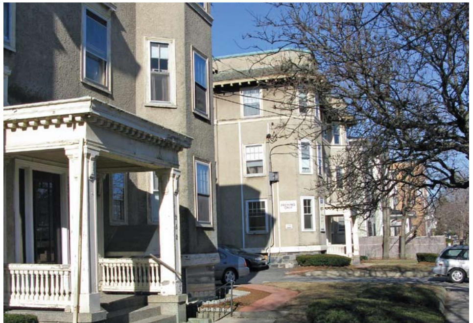
Significant renovations will be made to all 32 apartments, common areas, and exteriors.